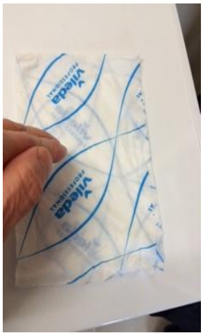
5 take cloth keeping it folded