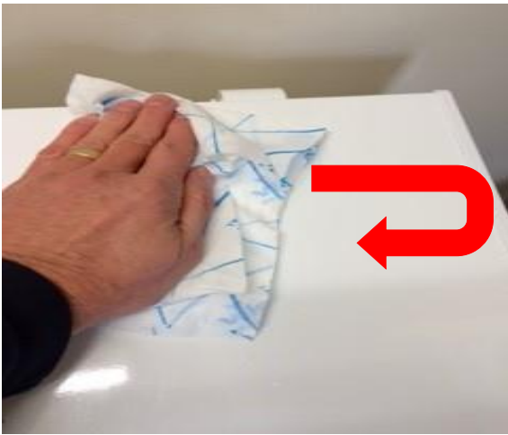
Wipe using over lapping method