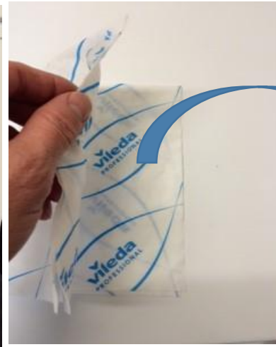
After wiping first surface, turn over cloth, repeat so all 8 sides are used